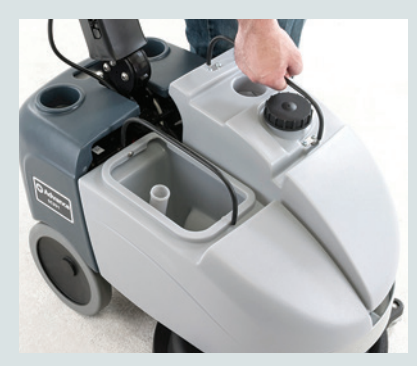
Easily remove the recovery and solution tanks to fill, drain and clean them away from the machine.