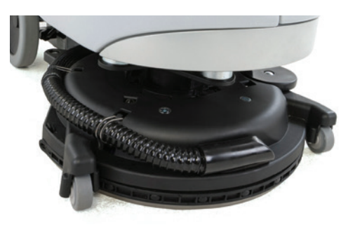
The SC351's rotating deck allows for both forward and backward scrubbing. Operators can push the machine forward in all directions like a "normal" scrubber. But, if the application requires, operators can quickly flip the machine up, triggering the deck to rotate completely for backward scrubbing performance. The scrub deck efficiently guides the wheels for superior edge cleaning.