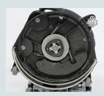
The SC351<sup>™</sup> squeegee system provides increased vacuum performance for better water pick-up. The tools-free squeegee can be easily and comfortably removed for cleaning.

high—allow operators to easily match diverse application requirements.