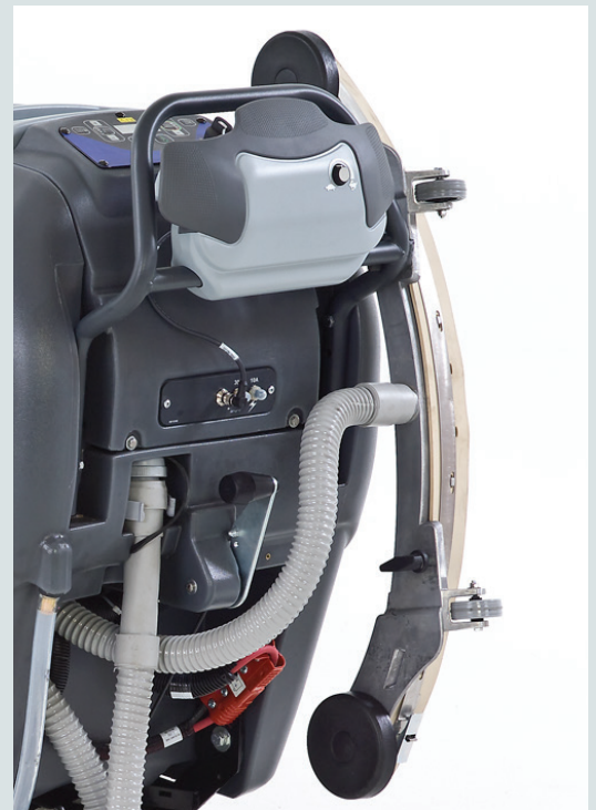
A built-in squeezegee hanger makes transport easier and reduces trip and fall accidents.

One-Touch™, integrated scrub pressure and solution flow rate settings: