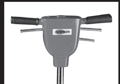
Easy-to-use, fingertip controls.