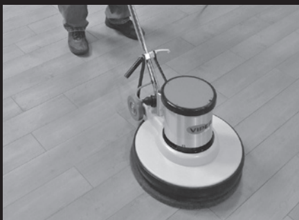
Engineered to withstand heavy, daily use in commercial settings.