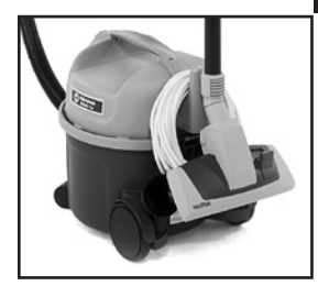
The unique parking solution means that the VP300 can be easily stored or transported, even when space is limited.