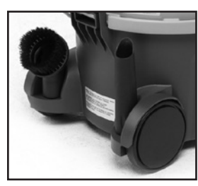
Discreet storage for nozzles allow all the tools you need to be within easy reach at all times.

Ergonomically designed carrying handle to allow comfortable and safe transport